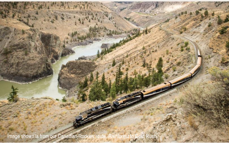
Image shown is from our Canadian Rockies route, Rainforest to Gold Rush.